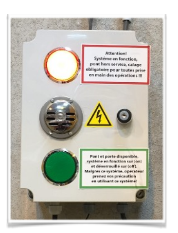
Interior Electric Control Box