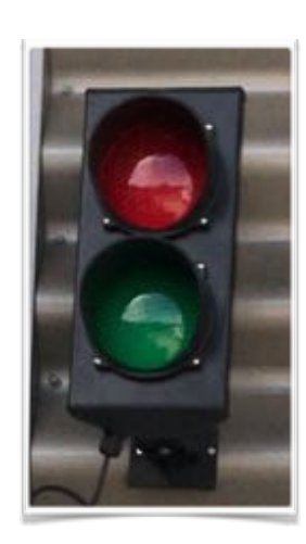
Exterior traffic light